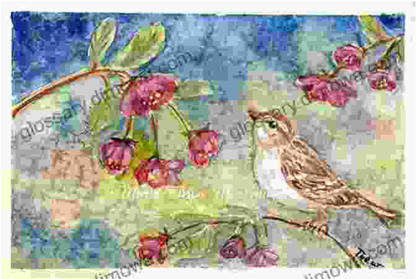
Painting 2: Sparrow and Cherry Blossoms

A delicate sparrow perches on a branch of cherry blossoms in this serene and poetic painting. The soft brushstrokes and subtle colors capture the fleeting beauty of spring and the delicate nature of the bird. Jakuchu's keen observation of the natural world is evident in the intricate rendering of the sparrow's feathers and the delicate petals of the cherry blossoms.