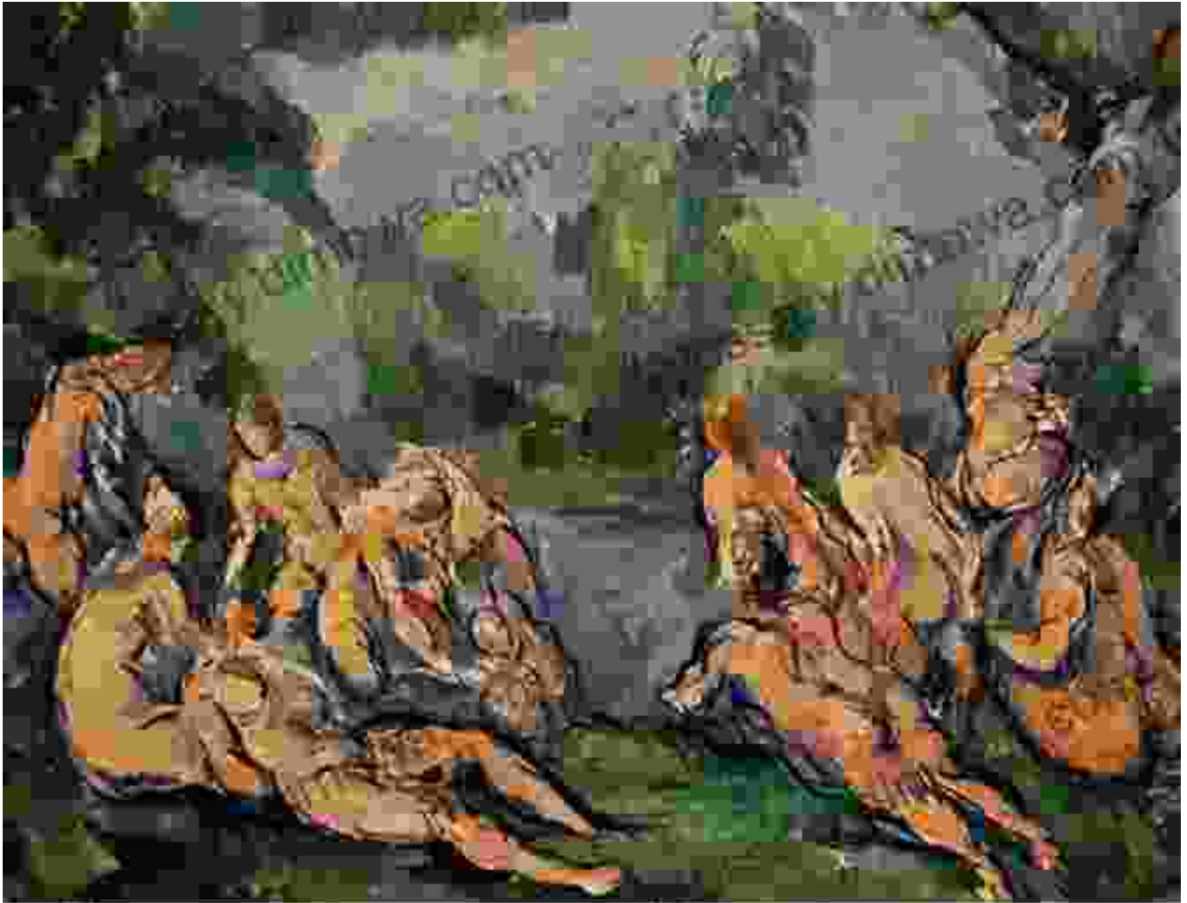
The Blue Nude (1906-1907) by Paul Cézanne, Musée d'Orsay

One of Cezanne's most famous and provocative Nudes, this painting features a solitary female figure with a delicate blue tint. The use of color and simplified forms creates a sense of both vulnerability and strength.