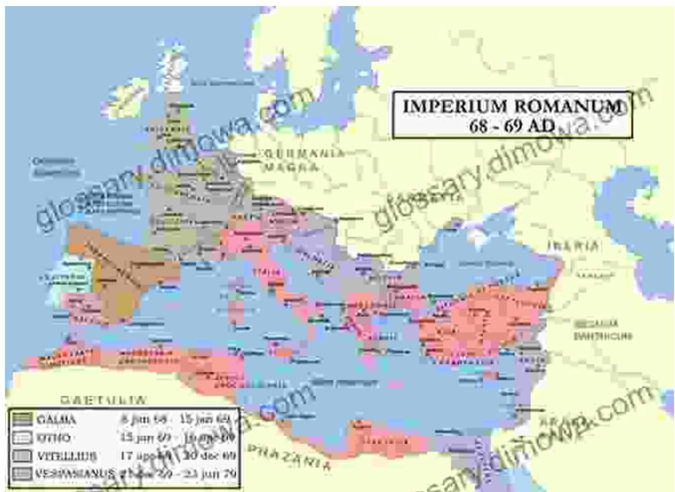
Map of the Roman Empire in 69 AD

Beyond the captivating narrative, "Year of the Four Emperors" presents a wealth of historical treasures, including excerpts from ancient sources, detailed maps, and stunning illustrations. These elements enhance the reader's understanding of the time period and bring the events to life.