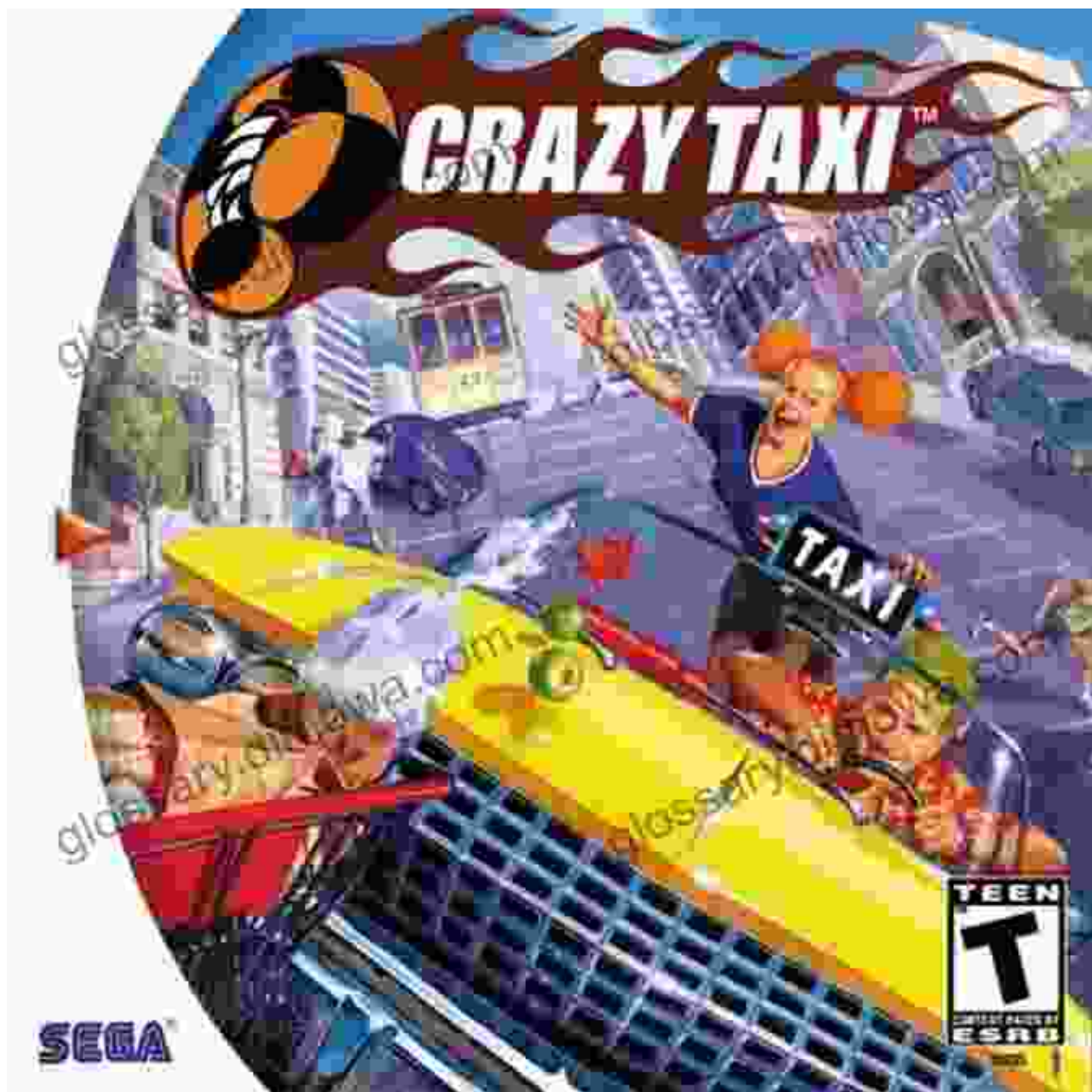
Crazy Taxi game cartridge

An arcade-style driving game that captured the chaos and exhilaration of urban driving, Crazy Taxi featured an open-world environment, vibrant graphics, and a catchy soundtrack. Its unique gameplay and memorable characters made it a fan favorite.