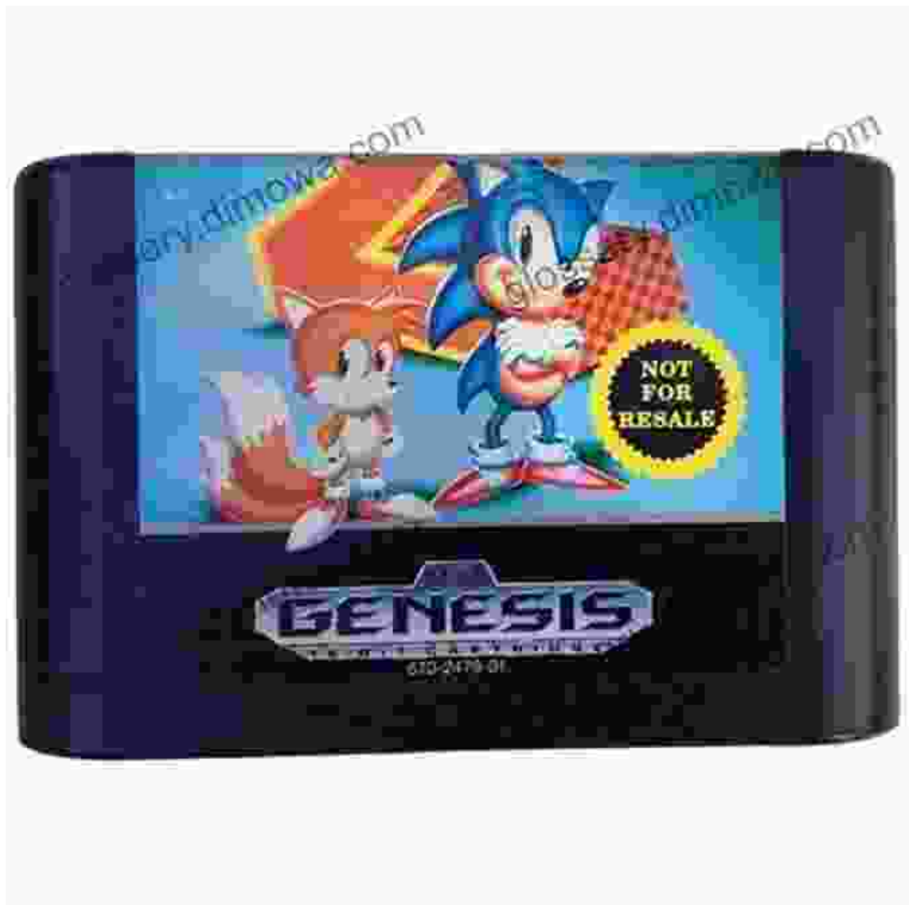
Sonic the Hedgehog game cartridge

Sega's iconic blue blur, Sonic the Hedgehog, became the company's mascot and one of the most recognizable gaming characters of all time. The high-speed platformer captivated audiences with its vibrant graphics, catchy music, and addictive gameplay.