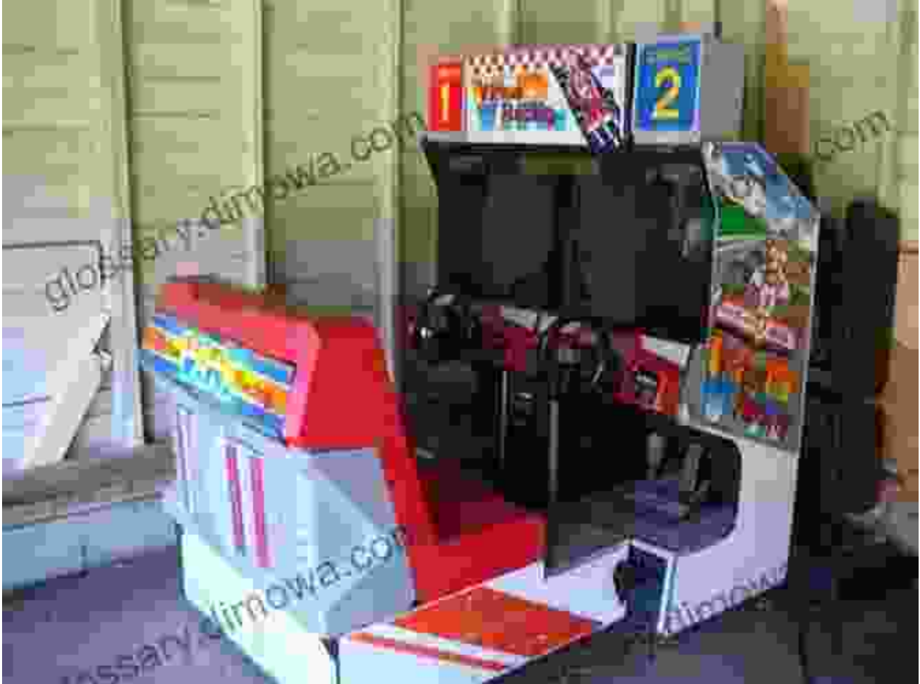
Virtua Racing arcade cabinet

Sega's entry into the 3D racing genre, Virtua Racing, showcased the power of the Model 1 arcade board and featured realistic graphics and immersive gameplay. It set the stage for future racing triumphs.