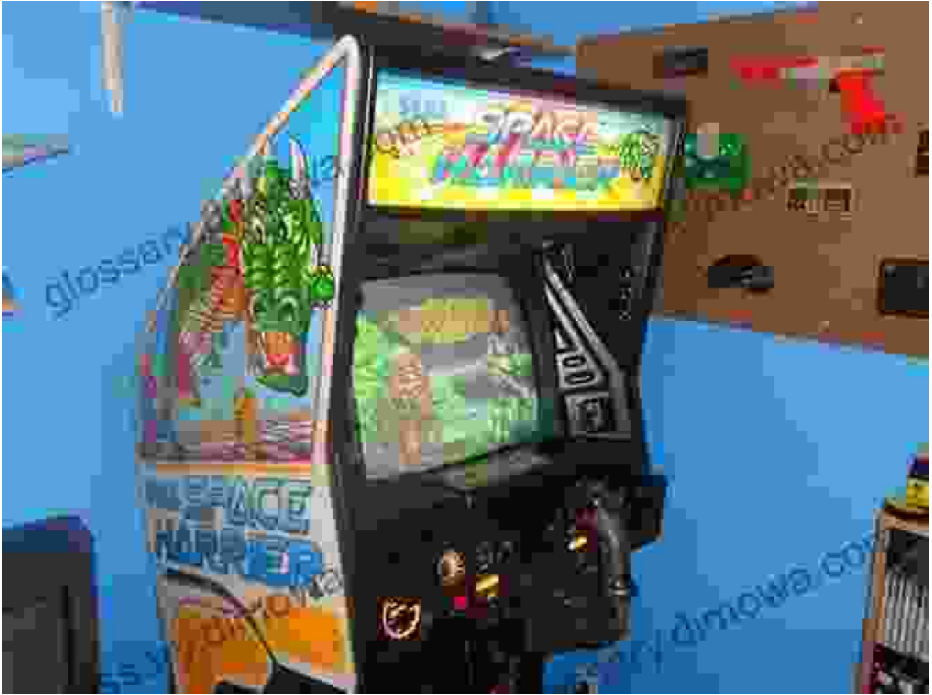
Space Harrier arcade cabinet