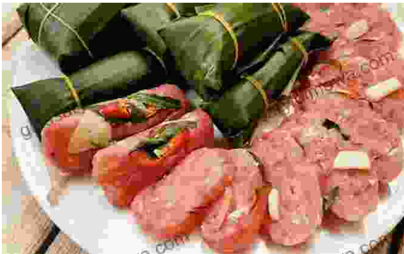
Nem Chua Yen My, a unique and flavorful fermented pork sausage

then stuffed into a casing made from pig intestine. The sausages are then fermented for several days, which gives them their characteristic slightly sour and salty flavor. Nem Chua Yen My is typically served cold, sliced into thin pieces, and paired with a dipping sauce made from fish sauce, vinegar, and chili peppers.