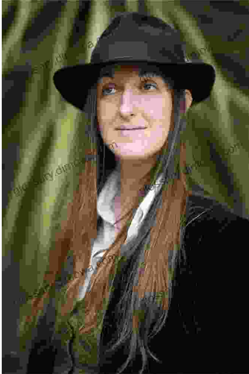
The Light Bearer by Frances Hardinge